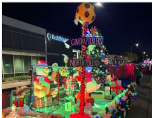
( https://usapickleball.org/news/award-winning-float-in-covina-christmas-parade-dedicated-to-pickleball/ )

Award-Winning Float in Covina Christmas Parade Dedicated to Pickleball